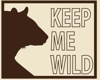
A campaign for all wild animals.